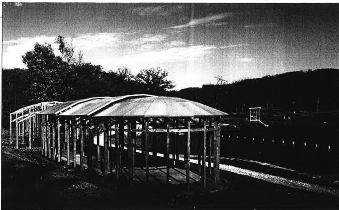
(Left) Sheltered observation is provided by pavilion structures.