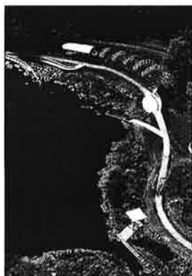
(Above) Aerial view to the west edge of pond

The Science Center of Iowa, on the eastern hill above Greenwood Pond, had hopes for the area to become an outdoor classroom where visitors, especially children, could learn first-hand about ecology. The Parks and Recreation Department wanted a viable, safe and low-maintenance facility that would retain its stature as one of Des Moines' favorite parks. These were joined by the Polk County Conservation Board and the Iowa Natural